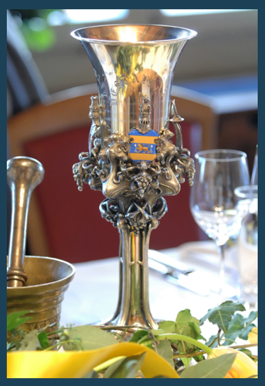
The cup used by the master of the Saffran Guild

The name of the guild comes from the German word for the spice saffron, which was the source of the wealth generated by the merchants who traded it. In addition to liberal professions such as doctors, dentists and lawyers, professionals