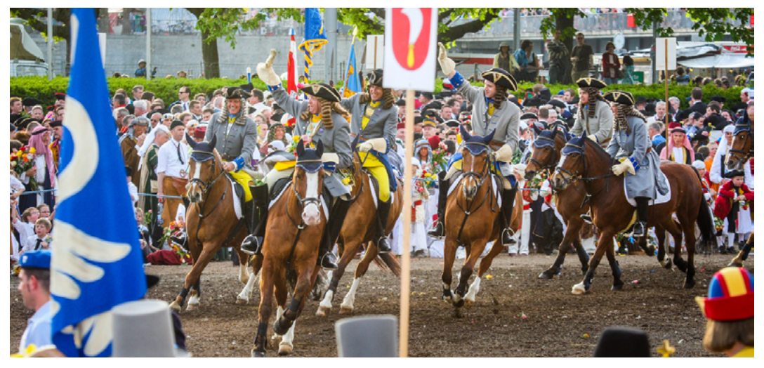
Riders from the Saffran Guild ride around the Böögg

guild's property and the "Zunfthaus zur Saffran" (the guild house) for future generations. In keeping with the tradition of the guilds, no expense was spared when furnishing the building. "The guild house, which is a listed building, is maintained by the guild without any assistance from